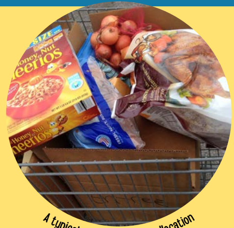
A typical food distribution allocation

groceries. Meanwhile, 36,164 hot plates of food were served at Manna's community meals. All in all, Manna Cafe distributed 2,237,294 pounds of food to Montgomery and Stewart Counties!